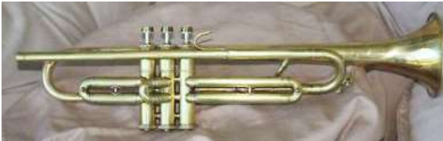
Musketeer Maestro #52xxx c.1940 (auction photo)