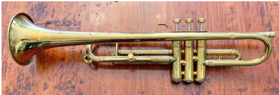
Musketeer Maestro #42959 c.1939