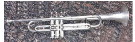
MM #35775 c.1939